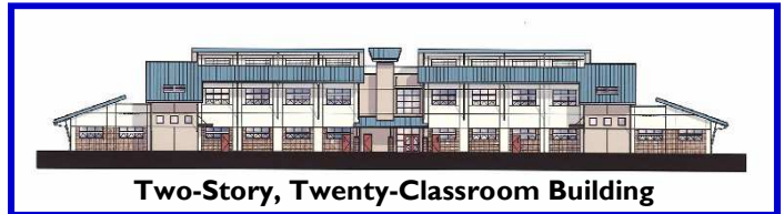
Two-Story, Twenty-Classroom Building